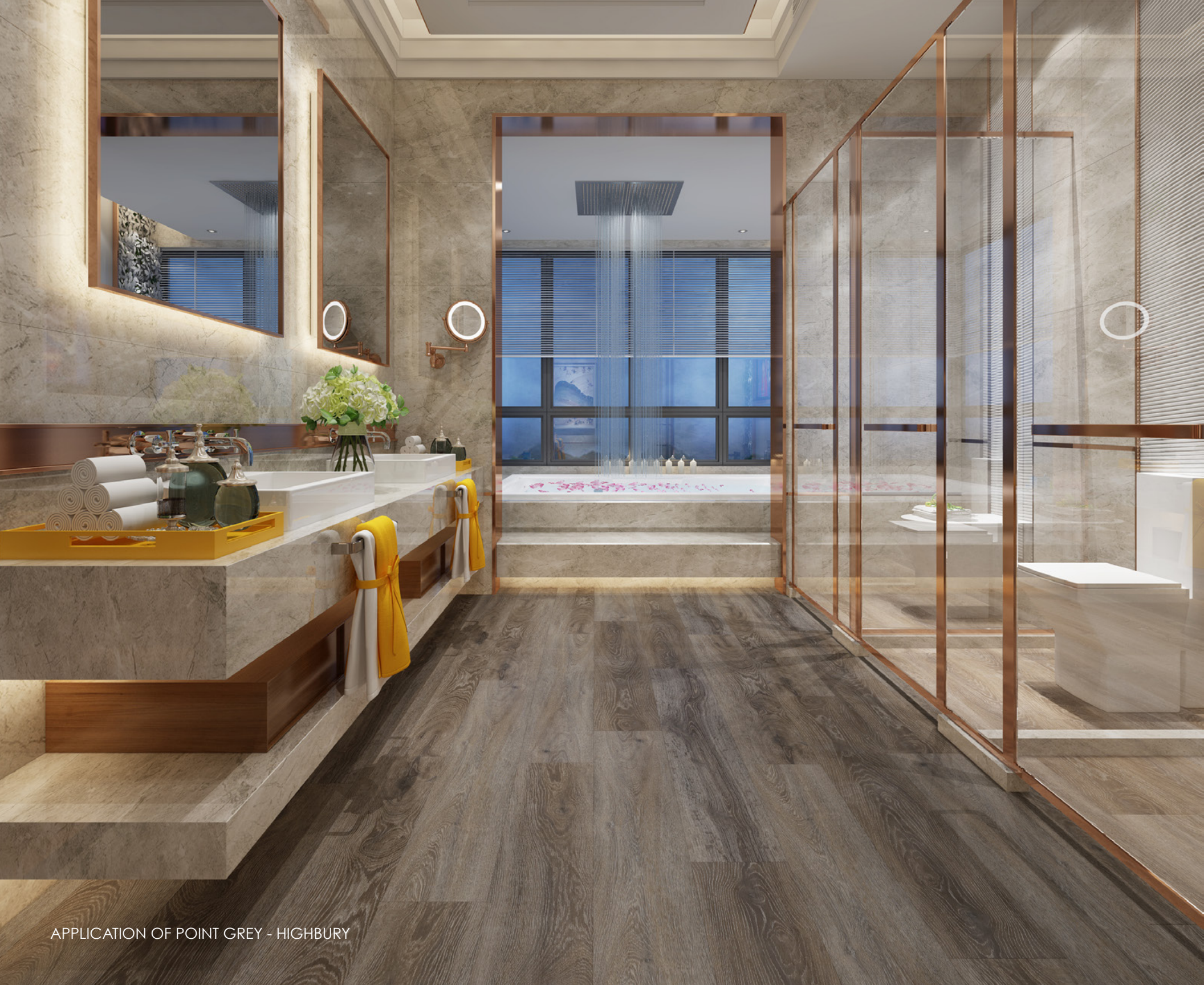
APPLICATION OF POINT GREY - HIGHBURY